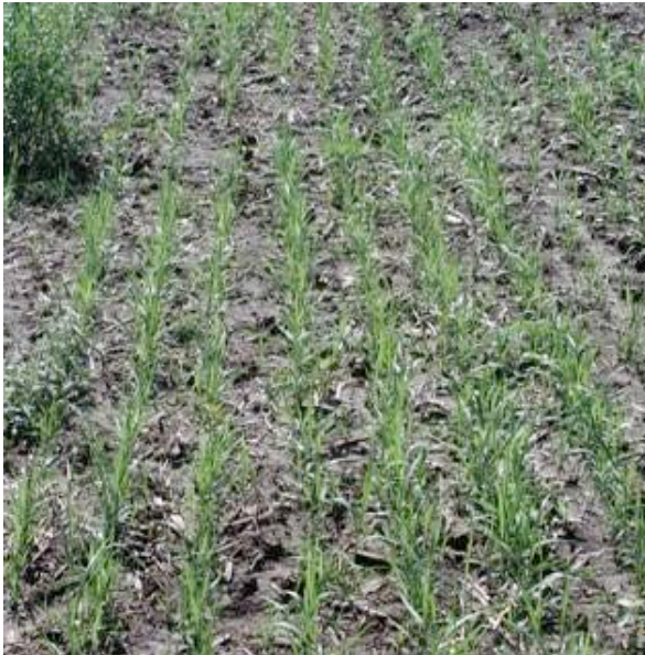
Switchgrass in June

Switchgrass ( Panicum virgatum ) is a vigorous warm season, native perennial grass adapted to Wisconsin and planted for many purposes including livestock grazing, wildlife cover, and as a biofuel crop. Switchgrass begins growth in late spring and continues through the summer if moisture is available. It grows 3 to 6 feet in small to large sodded clumps that spread slowly from numerous scaly creeping rhizomes. The leaves have a bluish cast and can attain a length of 2 feet. At the junction of the leaf blade and leaf sheath the ligule is a dense ring or cup of hairs on the upper leaf surface. The panicles are pyramid shaped with many purplish spikelets. Under native conditions it is usually found along creeks, streams and protected areas, but establishment and productivity has been best in fields with loam to sandy loam soils.