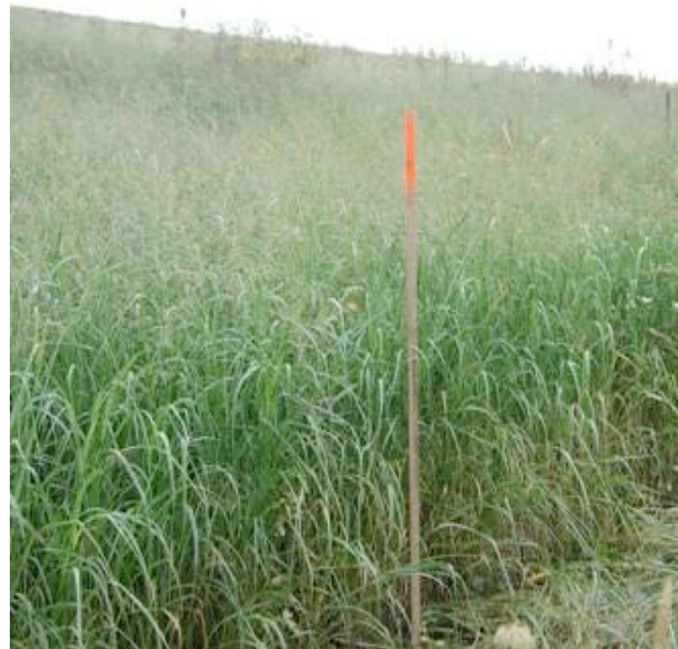
Four Months' Growth in October